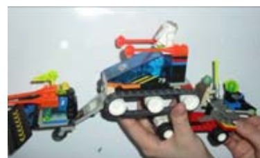
6th Class Lego space creations

Happy New Year to you all. We had lots to talk about when we returned to school after the