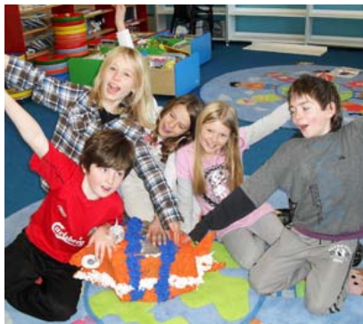
4th Class made pinatas (above) and held a Talent Show (below)

4th class are looking forward to working on "The Wizard of Oz" with our friends in 3rd class. Parts have been allocated and practices are under way. We have also been