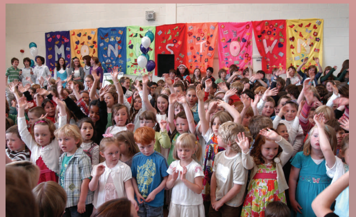
Third Class made a lovely presentation on the celebration of Ramadan