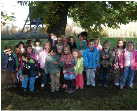
Junior Infants visited the nearby Chestnut trees

Our new cluster of nestlings have settled in their new nest and